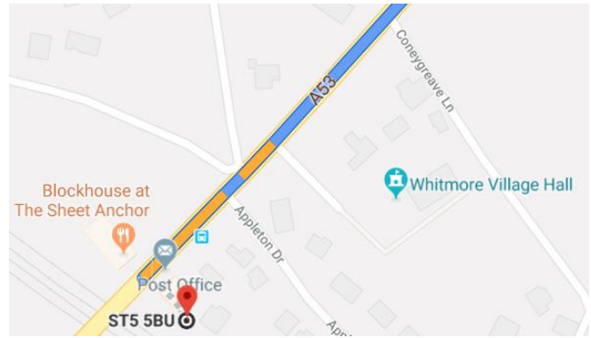
Arriving at the village hall from the M6 direction