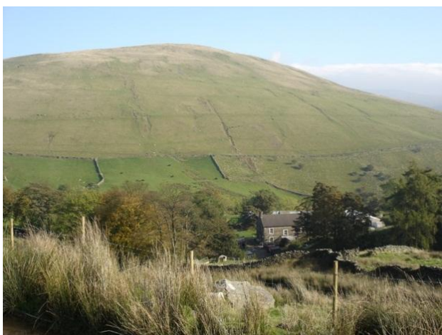
Adamthwaite Farm, and the Howgill Fells

"There are many attractively situated farmhouses in the side valleys of the Howgills, none more so than Adamthwaite, deep set amongst lovely trees and in scenery reminiscent of a Scottish glen. It is remote, unsuspected and rarely seen".